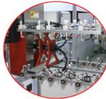
PCB Exchange PCB转换