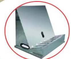
V Magazine V型托盘