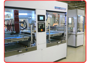
Front View 正视图