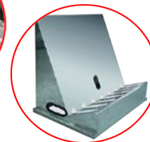
V Magazine V型托盘