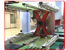
PCB Exchange PCB交换