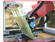
PCB Picker PCB 提取臂