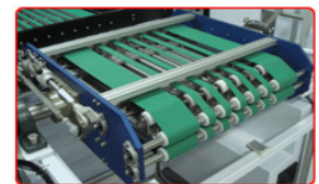
Flip Over Unit 翻转机构